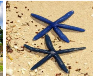
One of various starfish Species in Astoria Bohol