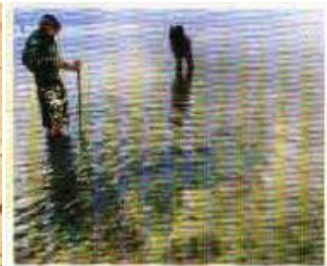
Early morning marine life exploration