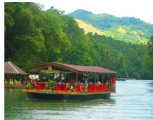
River cruise with Floating Restaurant

Tel: (+038) 540-9788, (+63) 9088996088 Fax: (+632) 910-0370 E; sales@astoriabohol.com W; www.astoriabohol.com